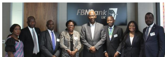
FBNBank UK District Exco & Some Past Chair during courtesy visit on 29/08