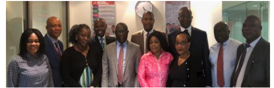
GTBank UK - 12th August 2019